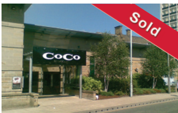
BRADFORD, WEST YORKSHIRE NIL PREMIUM Leasehold High quality fully fitted bar/club premises. 1,100 capacity. 6am Licence. Free of tie. North Ref: N-115490