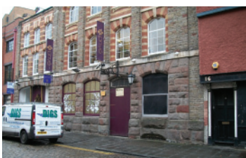
BRISTOL NIL PREMIUM Leasehold Prime position on King Street. 240 capacity. Vaulted ceilings. Shell spec. New lease. West & South Wales Ref: W-92801