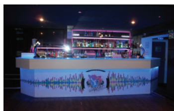
BRIGHTON £50,000 Leasehold Prime seafront location. Close to city centre. Refurbished throughout. New FOT lease available. South Ref: S-112215