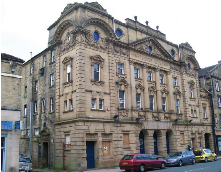
HALIFAX, WEST YORKSHIRE NIL PREMIUM Leasehold Leisure opportunity available with A3/A4/C1 use. Substantial town centre unit. North Ref: N-014989