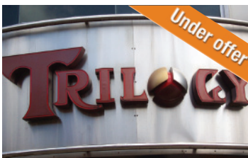
TOWN CENTRE DONCASTER NIL PREMIUM Leasehold Substantial fully fitted nightclub (2,260 capacity). 6.00am Licence. Prime circuit position. North Ref: N-015164