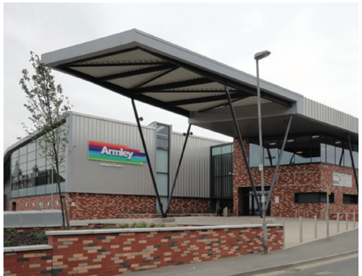
ARMLEY, WEST YORKSHIRE NIL PREMIUM Leasehold Licensed Café and Bar opportunity in brand new leisure centre in busy location. North Ref: N-914109