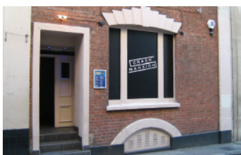
BRISTOL OFFERS INVITED Leasehold City centre, late night bar/club. Free of tie lease. High standard refurbishment. West & South Wales Ref: W-92667