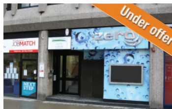
SCARBOROUGH, NORTH YORKSHIRE NIL PREMIUM Leasehold Town centre club, prominent junction. Flexible lease terms. Prime for a new offer. North Ref: N-015426