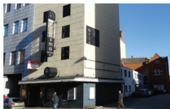
DONCASTER, SOUTH YORKSHIRE NIL PREMIUM Leasehold Substantial partly fitted nightclub, 3.30am Licence. Free of tie, flexible terms. North Ref: N-913779