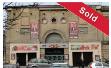
HUDDERSFIELD CIRCUIT BAR/CLUB NIL PREMIUM Leasehold High quality fully fitted bar/club in central location. 11,000 sq ft GIA. Free of tie. North Ref: N-015336