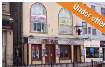
STOCKTON, TEESSIDE NIL PREMIUM Leasehold Fully fitted high street late night bar in prime central location. Free of tie. North Ref: N-015425