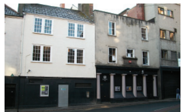
BRISTOL £395,000 Long Leasehold Fully refurbished, city centre, 300 capacity. Strong reputation. Peppercorn rent. West & South Wales Ref: W-92798